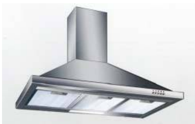
CCH1 & 2