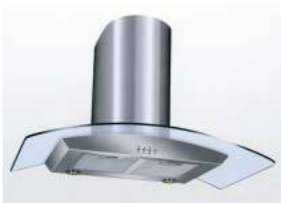
CCH3 & 4

To register ownership, please ensure you complete and return the guarantee card supplied with the appliance.