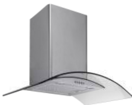
CGC600SS & CGC700SS